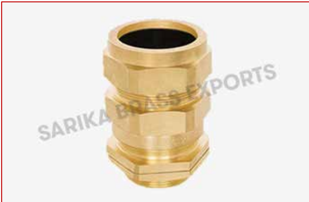
A1/A2 Type Cable Glands

Cable Glands are produced in a number of different materials and many components are designed specifically for a market solution.