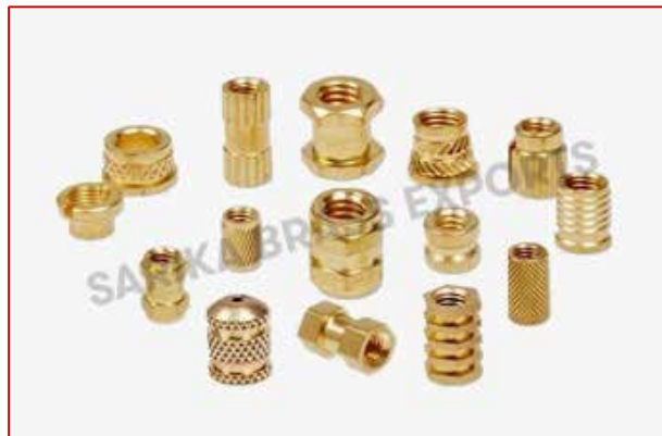
Brass Molding Inserts