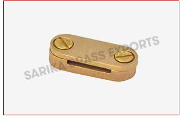
DC Tape Clip