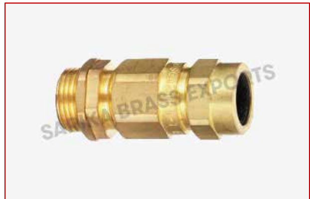
E1w Type Cable Glands