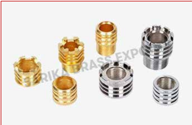
Brass PPR Fittings

We can manufacture and export Brass Inserts as per specifications (custom drawing and samples)