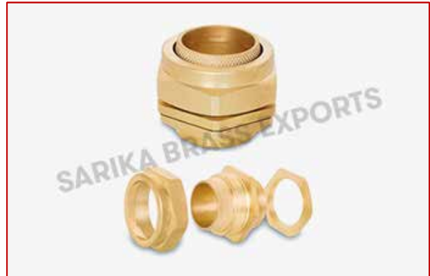
BW Type Cable Glands