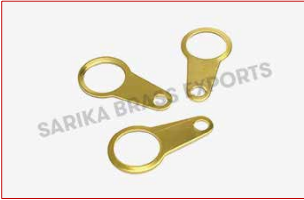
Brass Earth Tags