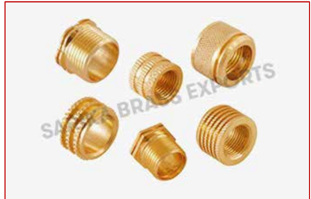
Brass CPVC Fittings