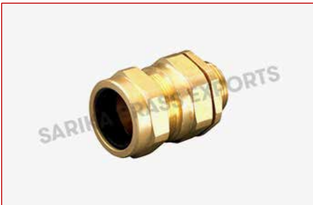
Cw Type Cable Glands